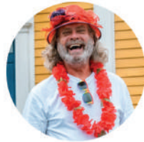
Crew Member Recipient of $250 Donation

For every $200 raised during the Matching Gift Campaign (May 15 - June 15) you'll receive one entry into a draw to win 1 of 10 $250 donations (2 winners per week), to be added to your personal fundraising page.