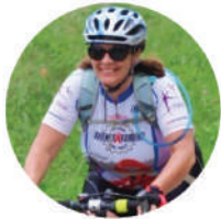
6-Day Rider Recipient of $250 Donation